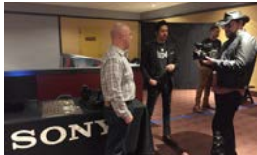
Partner SONY giving a demonstration.